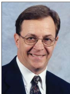
Tom Rucker Video Studio