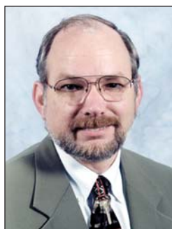
Richard Cravy Technology